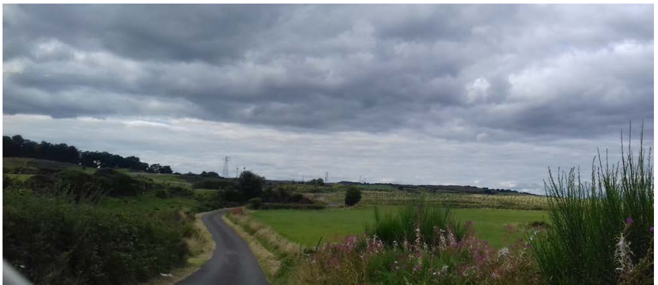
Cloak Road - looking west

Along the route of the new overhead line there is to be a 70m wayleave and trees are to be felled within this corridor as follows.