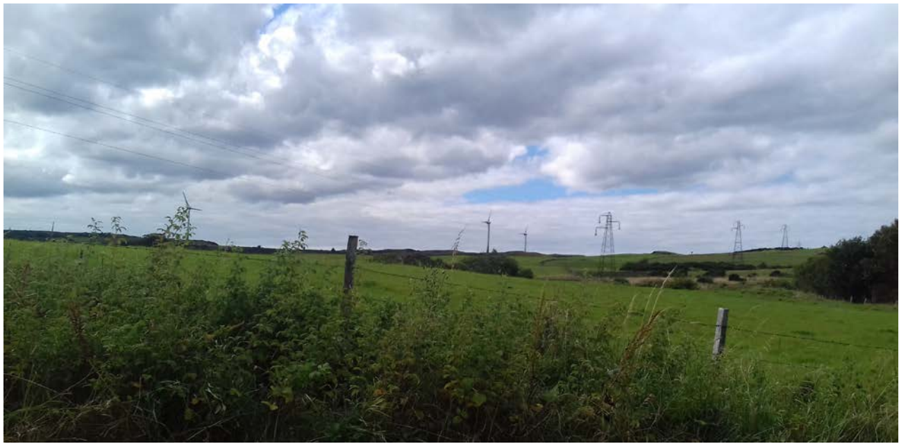
Auchenbothie Road - looking west

The overhead power line is to run from Erskine Substation located in the Renfrewshire Council area to the Devol Moor Substation in Inverclyde. The Erskine Substation is adjacent to and north of the M8 where the slip road leads to the M898 Erskine Bridge. Devol Moor Substation is located in the Green Belt approximately 2km to the south of Greenock and Port Glasgow and approximately 4.5km to the north-west of Kilmacolm.