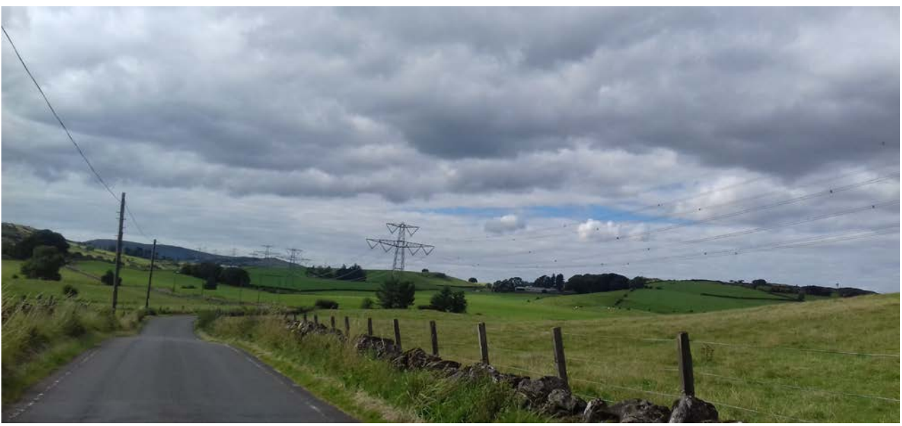
Between B788 and Auchenbothie Road - looking west

Given the relative close proximity of the new overhead line to these particular cultural heritage assets there is potential for their settings to be affected.