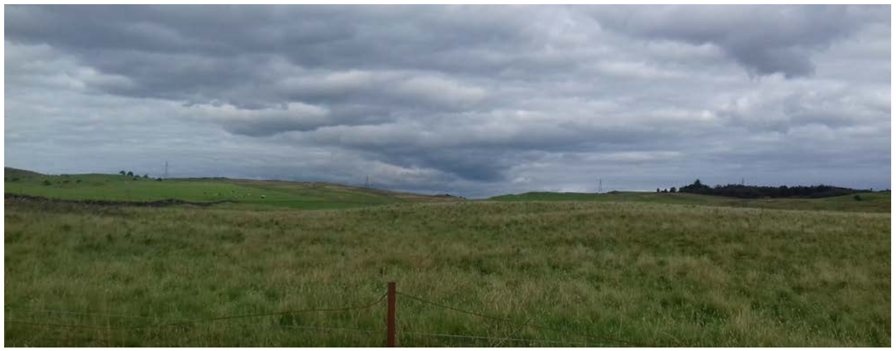
Between B788 and Auchenbothie Road - looking north

The existing overhead line is over 75 years old and is coming to the end of its operational life and requires to be replaced to ensure electricity supplies are maintained in accordance with the applicant's legal duties.