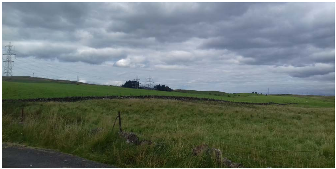
Between B788 and Auchenbothie Road – looking towards Devol Moor sub-station

The study area for the landscape and visual assessment is a 3km radius from the new overhead line and is accompanied with 11 representative viewpoints. Four of these are located in Inverclyde which are at the south side of Port Glasgow, Devol Road, B788 Kilmacolm Road and the junction of Port Glasgow Road and Auchenbothie Road with a fifth located just over the administrative boundary in Renfrewshire Council at Finlaystone Road.